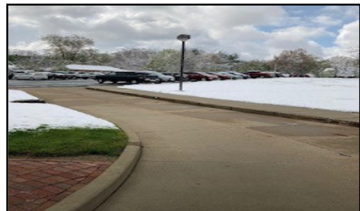
First Baptist Akron Parking Lot