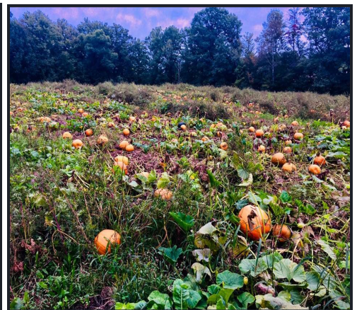
Koinonia Pumpkin Field